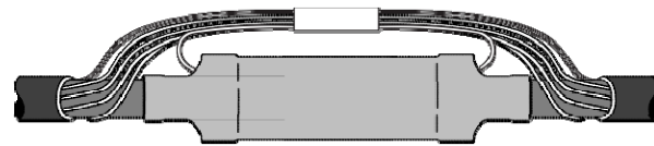
5417A-WG and 5418A-WG