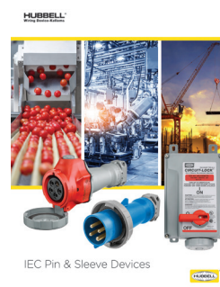
IEC Pin & Sleeve Devices