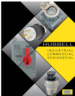
Full Line Catalog

Hubbell offers an extensive literature library for product support. Downloadable PDFs are available online.