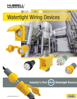
Watertight Wiring Devices